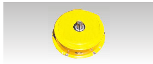
SPRING ASSEMBLY CONTAINER

No longer do you need to handle open springs which are difficult and dangerous to handle with sharp edges. All springs are now supplied in concealed containers for easy replacement. With containerised springs accidents are avoided during maintenance and replacements of springs.